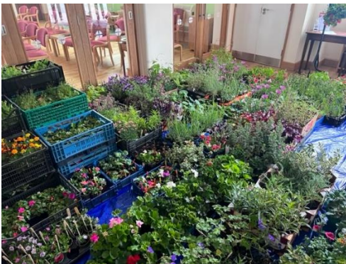
Friday - Some of the plants!

Thanks to everyone else who donated plants or who came along and supported us