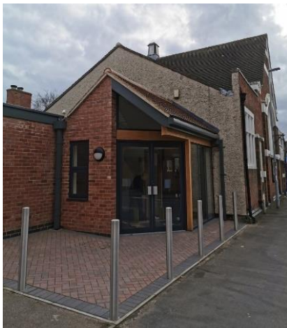
Our new entrance