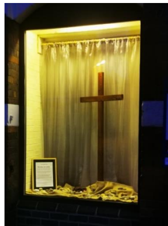
New Display window which was previously our "old, old" entrance