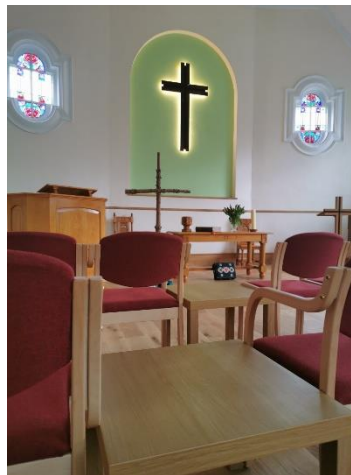
Our newly refurbished Worship Area