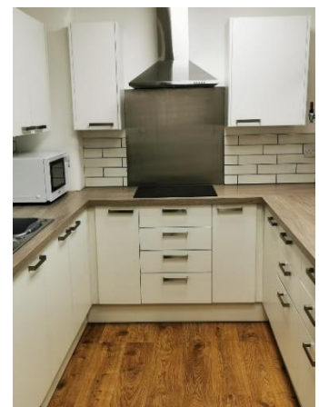
The new Welcome Coffee Bar kitchen