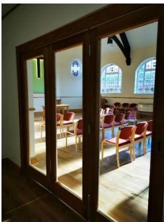
Glass doors separate the Worship Area from the Welcome Coffee Bar